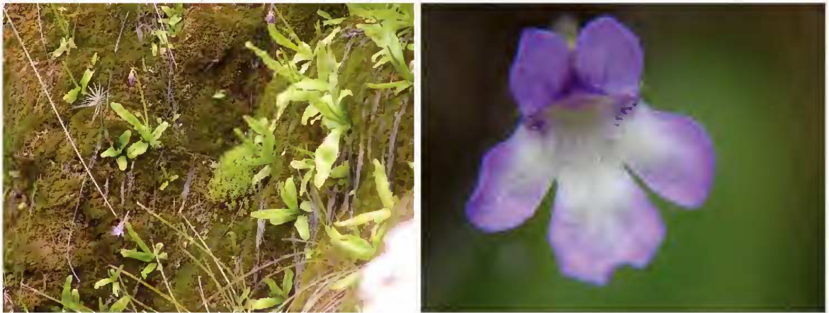
Figure 5: Pinguicula mundi , Sierra de Segura (left); P. mundi , Rio Mundo (right).

wet places in (sub-)alpine meadows. 2013 saw an unusual outbreak of winter in what should have been spring in the region. The unexpected snowfall even at low altitudes in late April caused several accidents and prevented us from seeing this butterwort at 1700 m alt.